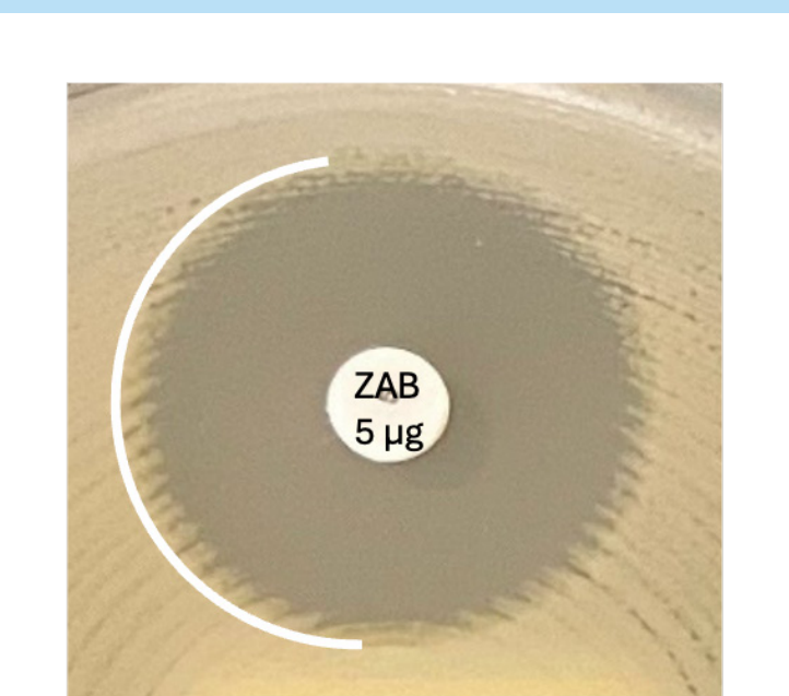
A. baumannii NCTC13304 Outer zone